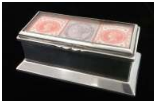
1015 Silver Box, Deakin & Francis (Birmingham) 1898 , sterling stamp box (82x40mm), inset windowed lid displaying three Great Britain stamps, flared base, spring hinged front opening top, three gold wash ramped compartments, scarce. Estimate. . . . . $400 - 600