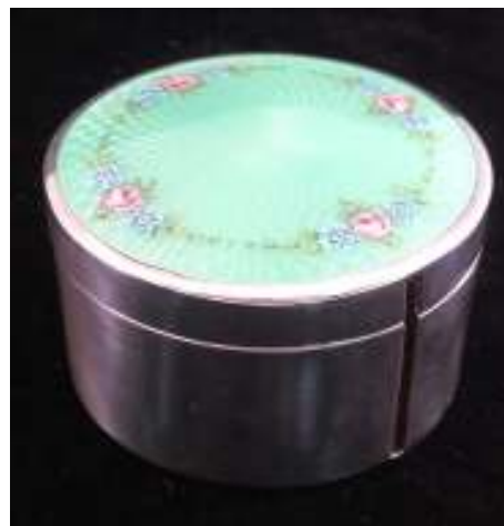
1139 Silver Coil Dispenser, Gorham Inc. (Providence, R.I.), sterling stamp coil dispenser (50x50mm), inset green guilloche enamel with floral accents on lid, hinged opening with gold wash interior and central spindle, marked sterling. Estimate. . . . . $150 - 200