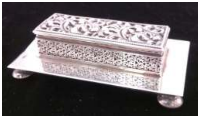
1020 Silver Box, George W. Shiebler & Co. (New York, N.Y.) , sterling stamp box (95x54mm), floral pierced lid and sides on wide flat base with balled feet, hinged front opening lid and three sloped compartments, gold wash interior, marked sterling. Estimate. . . . . $300 - 400