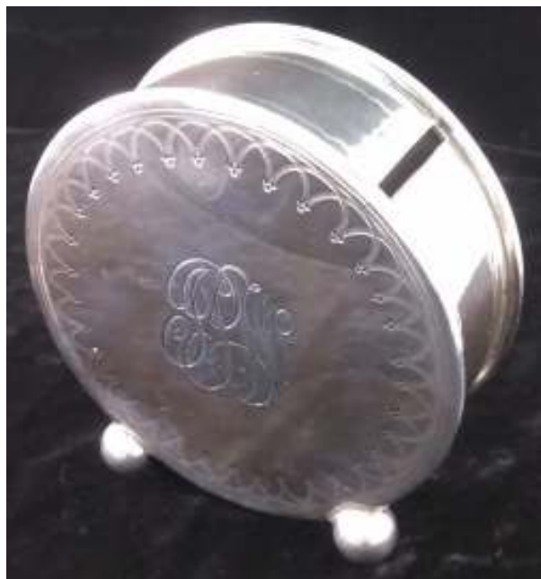
1137 Silver Coil Roll Dispenser, Shreve, Crump & Low Co. (Boston, Mass.), sterling 1,000 stamp coil roll dispenser (90x32mm), circular form on balled feet, pattern bordering with monogram on one side, compartment with spindle and dispensing slit near top, most attractive. Estimate. . . . . $400 - 600