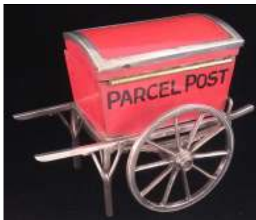
1008 Silver & Wood Box, Mappin & Webb (London) 1912 , sterling and wood novelty stamp box (93x57mm), Post Office cart form , wood body painted red with "Parcel Post" on sides and "G.P.O." at rear, silver wheel and undercarriage, hinged side opening lid with interior partially leather lined, extremely rare and unusual, ex-Davis Collection . Estimate. . . . . $1,000 - 1,500