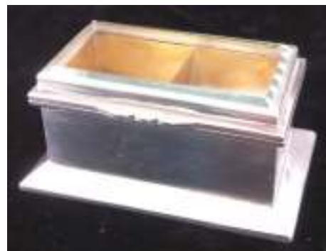
1021 Silver Box, Deakin & Francis (Birmingham) 1902 , sterling stamp box (62x40mm), front with spring closing lid with beveled window top, two ramped gold wash compartments, most attractive. Estimate. . . . . $300 - 400