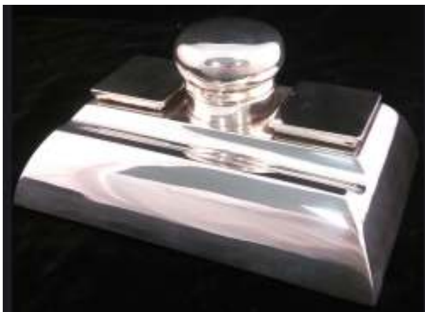
1010 Silver Box, Goldsmiths & Silversmiths Co. Ltd. (London) 1897 , sterling stamp box and inkwell combination (116x75mm), plain flared base, hinged balled lid at center opening to inkwell, hinged lids at either side opening to wooden ramped and concave compartments with gold wash interior, grooved pen rest at front, very scarce. Estimate. . . . . $750 - 1,000