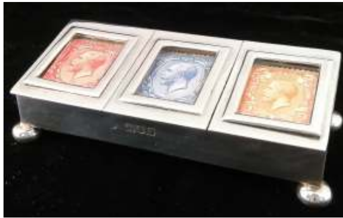
1006 Silver Box, George W. White & Co. (London) 1902 , sterling stamp box (88x37mm), sloped front and balled feet at base, three individual hinged windowed lids each bearing a different Great Britain stamps, each opening to a ramped compartment and gold wash interior, rare. Estimate. . . . . $1,000 - 1,500