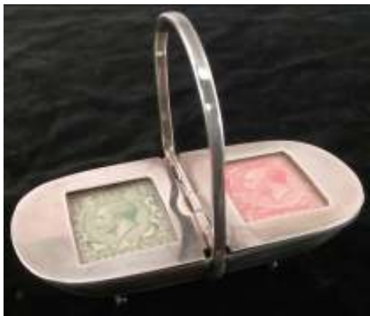
1009 Silver Box, Corneluis Saunders & Francis Shepard (Birmingham) 1913 , sterling stamp box (67x38mm), novelty garden trug form , two hinged window inset lids displaying stamps, opening to two gold wash compartments, very rare. Estimate. . . . . $750 - 1,000