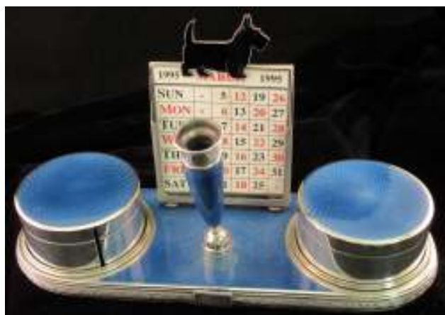
1154 Silver Desk Set , sterling coil roll box, inkwell box and matching base with pen holder and calendar (170x62mm), each with inset blue guilloche enamel, round coil dispenser with gold wash interior and central spindle, round inkwell box with glass inkwell, separate base with ball pivot pen holder and calendar back plate with black enamel terrier clip, boxes marked sterling. Estimate. . . . . $600 - 800