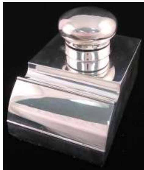
1017 Silver Box, George Betjeman & Sons (London) 1923 , sterling stamp box and inkwell combination (75x106mm), plain desktop style, front hinged pull down curved lid with three pocket style compartments on reverse of lid, additional wood inlay curved compartment inside, curved pen rest behind lid, top with balled hinged lid opening to inkwell, choice. Estimate. . . . . $400 - 600