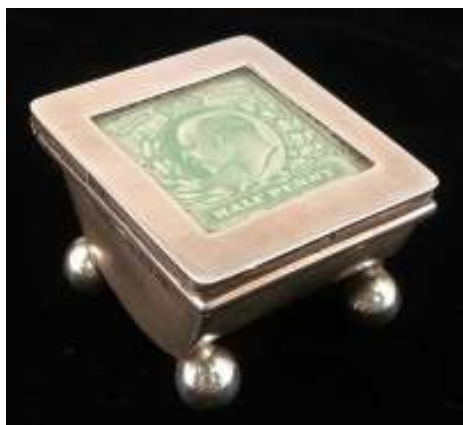
1019 Silver Box, Walker & Hall (Sheffield) 1904 , sterling stamp box (26x36mm), coal scuttle form , sloping front windowed lid displaying stamp, hinged front opening and single compartment, an unusual design. Estimate. . . . . $300 - 400