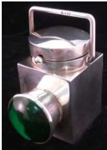
1007 Silver Box, Samuel Jacob (London) 1894 , sterling stamp box and inkwell combination (35x57mm), novelty railway lantern form , square form with green glass "light" at front, hinged lid opening to glass inkwell, additional hinged lid stamp compartment in lid, rare. Estimate. . . . . $1,000 - 1,500