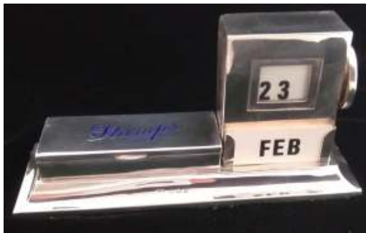
1011 Silver Box, H. Matthews (Birmingham) 1912 , sterling stamp box and perpetual calendar combination (165x56mm), on flared base, stamp box at left with blue inset enamel "Stamps" in script ion lid, hinged front opening with three curved compartments, gold wash interior, calendar at right with scrolling wheel at right to change day, bracket at base with six double sided month cards, very rare. Estimate. . . . . $750 - 1,000