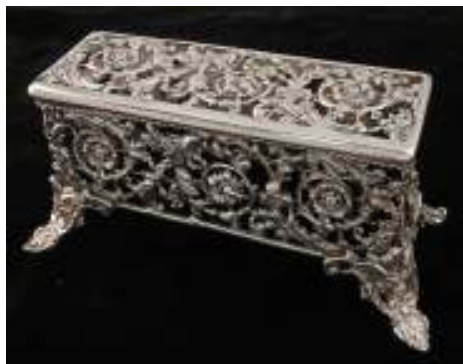
1016 Silver Box, George W. Shiebler & Co. (New York, N.Y.) , sterling stamp box (115x54mm), all over pierced floral design with flared feet, hinged front opening lid, four sloped compartments, marked sterling, very scarce. Estimate. . . . . $400 - 600