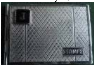
JC Reference Style 5