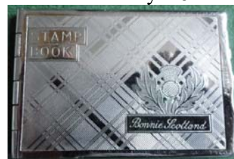
JC Reference Style 8

Similar action to style 7, but with a Scottish theme.