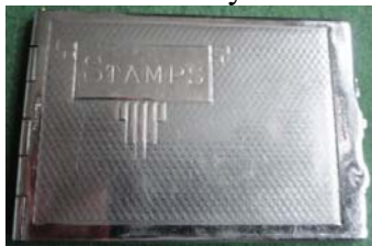
JC Reference Style 7