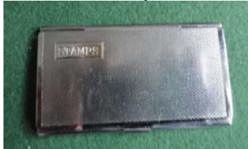
JC Reference Style 12