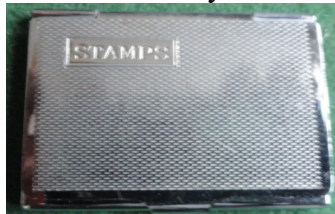
JC Reference Style 13

Smaller version with two compartments. (5 cm x 3.5 cm)