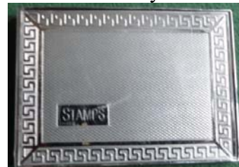
JC Reference Style 9

Spring loaded hinge with 2 clasps to hold postage stamps