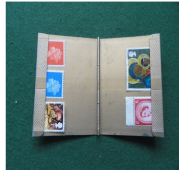
JC Reference Style 15