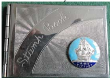
JC Reference Style 6

“Sunburst” Registered in 1934 (No. 790801)