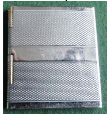
JC Reference Style 14

Smaller version with two compartments. (5 cm x 3.5 cm)